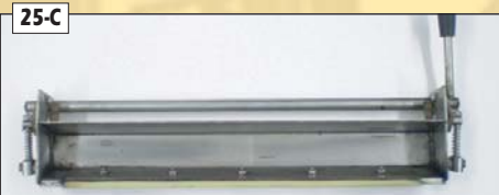
#A1.203.001-S #2 Unit (delivery)