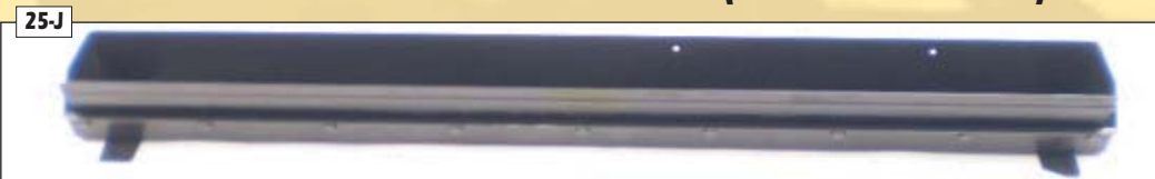
#1 Unit on 2 colors SORKZ #78.010.191-S SORMZ #88.010.191-S SORRZ #86.010.191-S SORDZ #96.010.191-S SORSZ #51.010.191-S