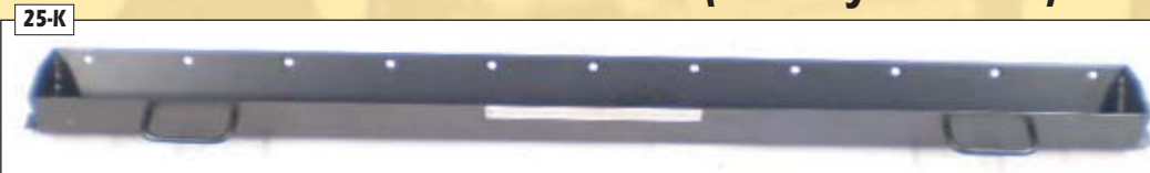
#2 Unit on two colors (all single colors) SORK/Z #58.010.191-S SORM/Z #68.010.191-S SOR/Z #66.010.191-S SORD/Z #76.010.191-S SORS/Z #41.010.191-S