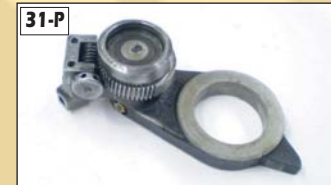
Swiveling Lever #93.030.004 Operator Side Lower