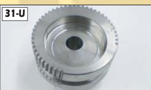
Water Form Cup, Op Side, Upper Call