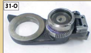
Swiveling Lever #93.030.005 Operator Side Upper