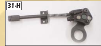
Lever #43.030.001F Operator Side Upper