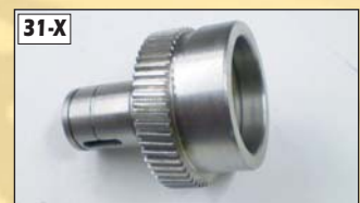
Water Form Cup, Op Side, Lower Call