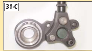
#42.030.006 Operator Side Lower