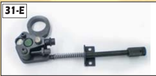
Lever #43.030.001F Drive Side Upper