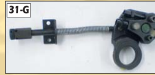
Lever #43.030.002F Operator Side Lower