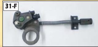
Lever #43.030.003F Drive Side Lower