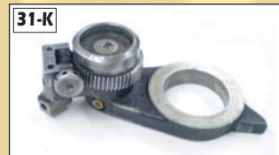
Swiveling Lever #66.030.005 Operator Side Upper