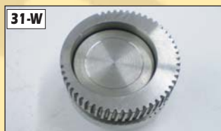
Water Form Cup, Drive / Side, Lower Call