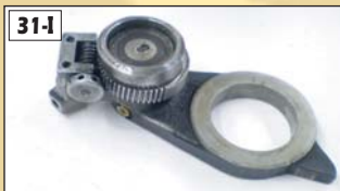
Swiveling Lever #66.030.002 Drive Side Lower