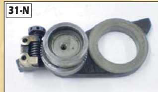
Swiveling Lever #93.030.003 Drive Side Upper