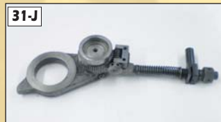
Swiveling Lever #66.030.003 Drive Side Upper