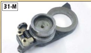
Swiveling Lever #93.030.002 Drive Side Lower