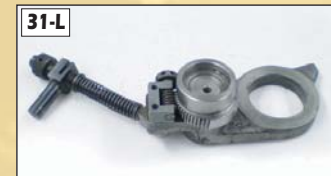
Swiveling Lever #66.030.004 Operator Side Lower