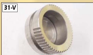
Water Form Cup, Drive Side, Upper Call