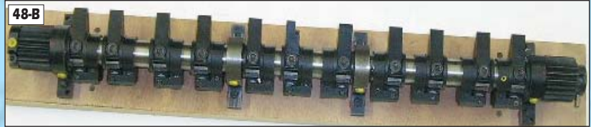
GTO52 / Printmaster 11 Grippers 4/3/4 #79.580.328S