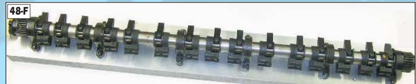
102 Speedmaster later 15 grippers 46mm wide gear #91.580.328S