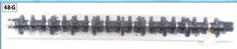
102 Speedmaster "newest" 19 grippers 46mm wide gear #91.580.328S