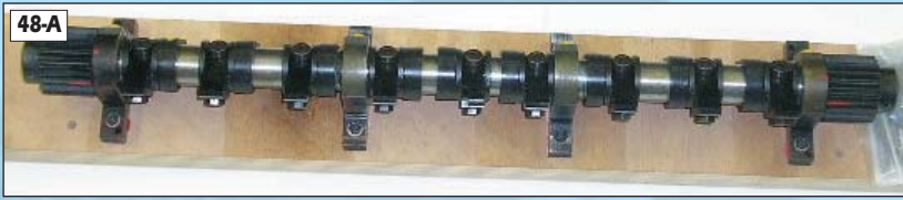
GTO46 Pincer Bar 9 Grippers 3/3/3 #52.580.328S