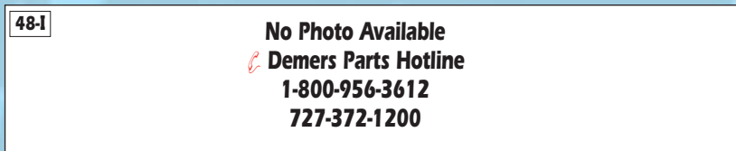
No Photo Available Demers Parts Hotline 1-800-956-3612 727-372-1200