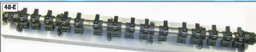
102 Speedmaster early 15 gripper fingers #91.580.328S 43mm Gear - Narrow Gear