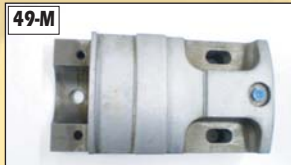
Block – Drive Side #53.580.314