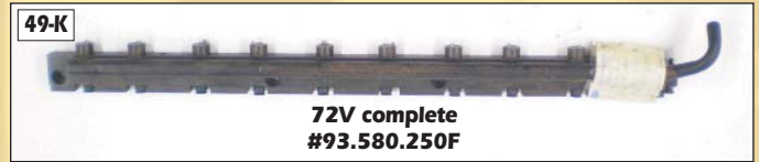
72V complete #93.580.250F