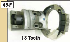
18 Tooth Drive Side 72 102 #91.580.309