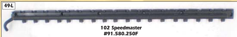
102 Speedmaster #91.580.250F