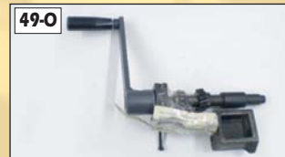
Handle Crank Assembly #74.004.201F