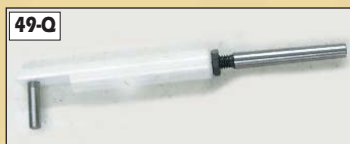
Perfecting Zero Gauges Call