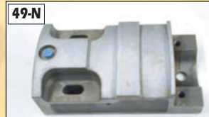
Block – Operator Side #53.580.318