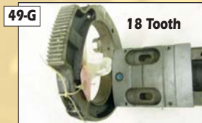
18 Tooth 72 / 102 Operator Side #91.580.309