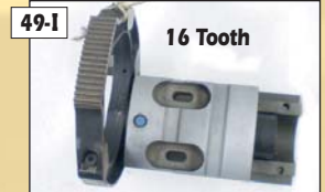
16 Tooth SM102 - and others #82.583.309 - Operator Side