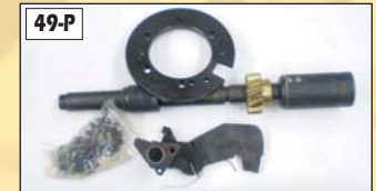
Handle Crank 102 /72 Call