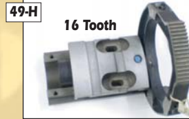
16 Tooth SM102 - and others #82.583.309 - Drive Side