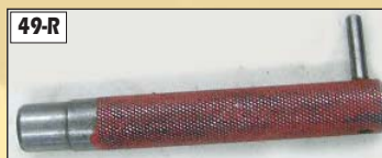
Perfecting Zero Gauges #82.806.805F