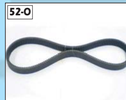
52-O KS / KSB / KSBA 50HZ cycle #KS.100.061 KS / KSB / KSBA European