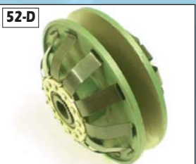
52-D GTO46/52 – one color Call