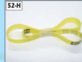
52-H 50HZ cycle #00.780.0475 EUROPEAN