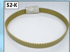
52-K GTO52 – Early #00.580.1755