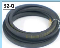
52-Q Drive Belt (2X) Part #B-85