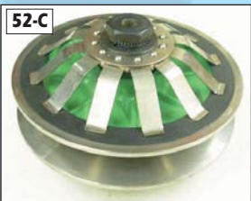
52-C K-Offset #KS.100.048F