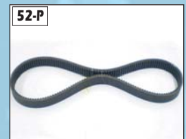
52-P K-Offset #KS.100.061 – 50HZ #KS.160.060 – 60HZ