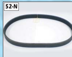
52-N KS / KSB / KSBA 60HZ cycle #KS.100.060 USA / CAN / MEX / S. AMER.