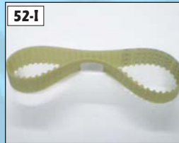
52-I GTO – Later #00.580.2447