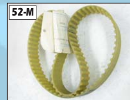
52-M MO-Offset #00.580.1529