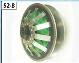
52-B K letterpress / Diecutter #KS.100.048F