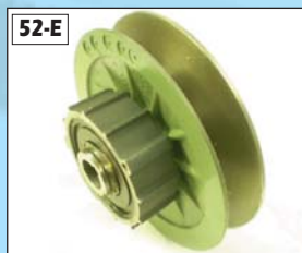
52-E GTO Z/P 46/52 color #42.090.048 (1-Color) #52.090.048 (2-Color) #62.090.048 (4-Color) Primary (Drive Motor) Pulley