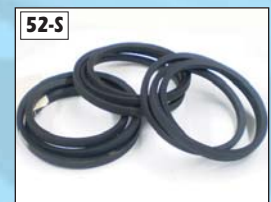
52-S SBD Drive Belt Part #B-67 (3X)