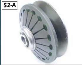
52-A Stahl Folder #11.213.16.920