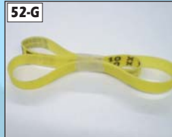
52-G 60HZ cycle #00.780.0476 USA / CAN / MEX / S. AMER.