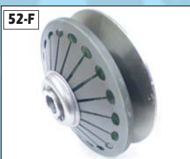
52-F GTO V/P 52 #42.090.049 (1-Color) #52.090.049 (2-Color) #62.090.049 (4-Color) Secondary Pulley