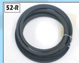
52-R Drive Belt (2X) Part #B-75