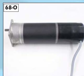
68-O GTO Servo Motor for Speed Control #69.101.1512