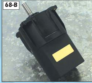
68-B Preset Print Press – New #61.144.1121NS