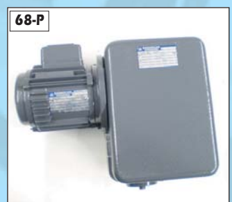
68-P Servo Motor w/Cams #83.101.1821