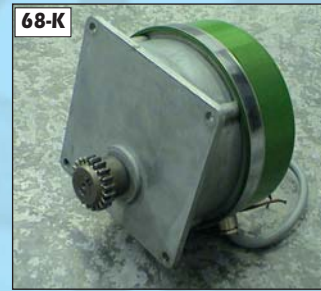
68-K Preset Print Pressure (short gear) green #MV.025.181