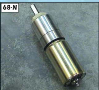
68-N Preset Gripper Height #61.144.1101