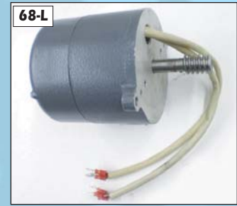
68-L Servo #00.780.0999