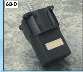
68-D Preset – Diagonal (Silver) New Style #71.112.1311.NS