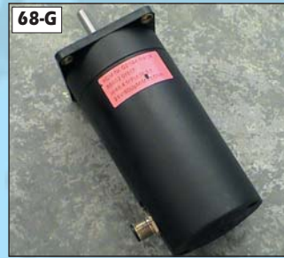
68-G Preset Sidelay (red long) #62.144.1141A