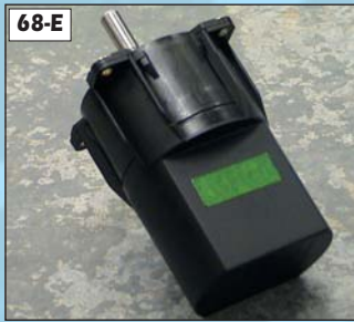
68-E Preset Servo Green #62.105.5151