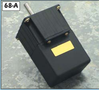
68-A Preset Print Pressure #61.144.1121