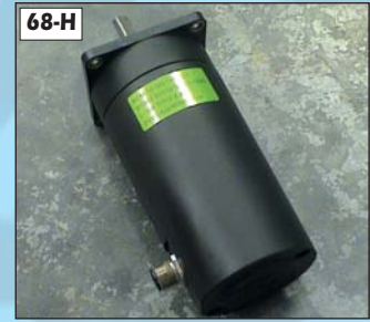
68-H Cooling Unit Green Servo (long) #M3.148.1311