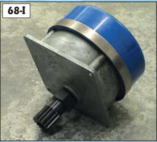
68-I CPC – Register Circumferential (long gear) blue #81.186.5141