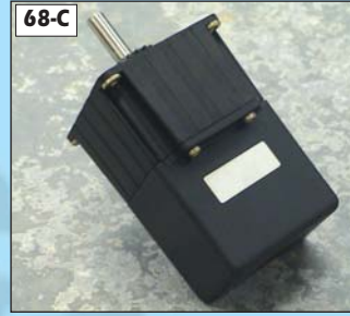
68-C Preset – Diagonal (Silver) #71.112.1311