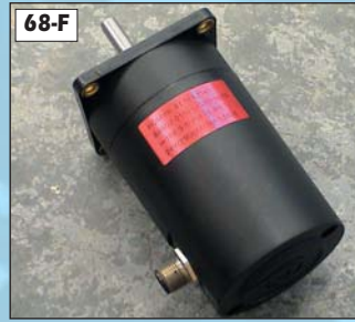
68-F Preset Sidelay #61.114.1141 (red short)