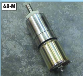
68-M Ink Ductor Sweep Motor #71.186.5121