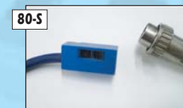
Ref 73 Operator Side #66.165.1531