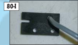
Answering Switch, ASUZ #93.110.1331