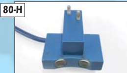
Perfecting Sheet Control #91.110.1321