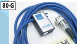
RL4, Impression Control #93.110.1321