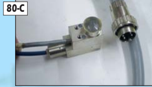
White Eye (4 Prong cable, very early) Call #SOR 110.032 #61.110.032