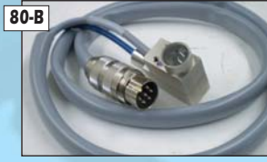
White Eye (6 Prong Cable, early) #71.110.1321