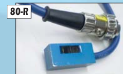
Ref 51 – Driveside #66.165.1521