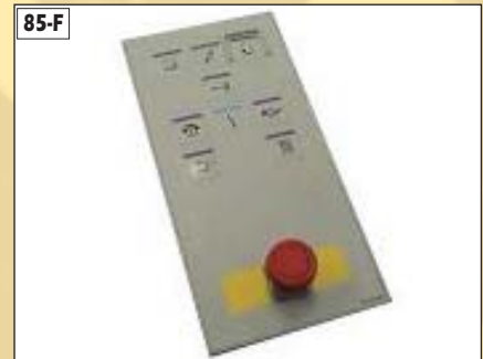
SM102 Pre Cp2000