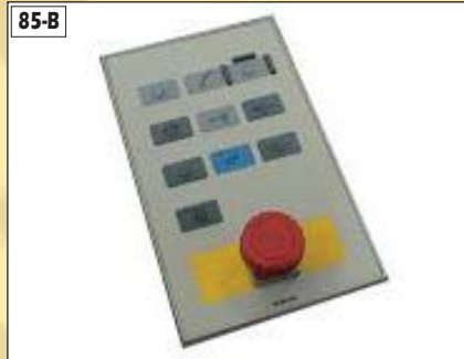
Stream Feed Early SM52