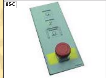
SM102 CP2000 Drive Side