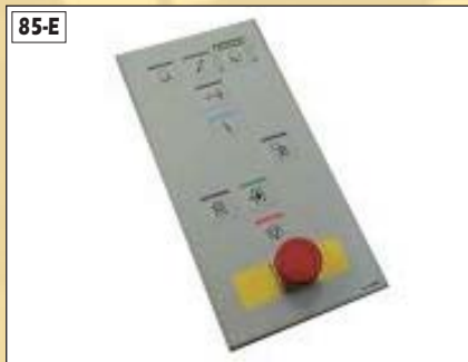
SM74 – CP2000 Coating Unit