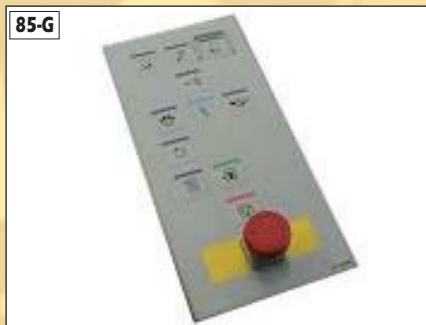
SM74 / SM102 –CP2000