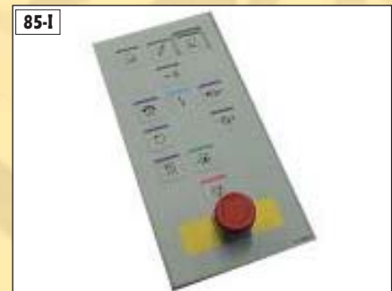
SM102 – PreCp2000