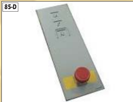
SM74 – CP2000 Drive Side