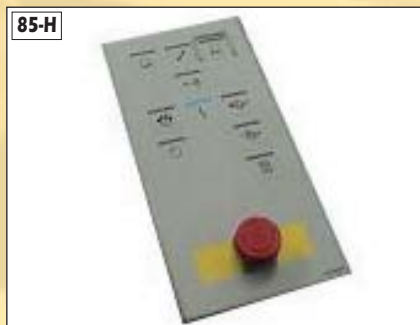
SM74 – PreCpTronics