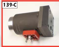
139-C Circulating Ball Valve #PO.035135