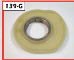
139-G Cam Disk #PO.017134