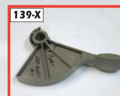
139-X Foot Switch Pedal