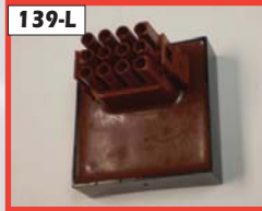
139-L Substitutional Board #PO.019548