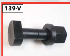
139-V Safety Bolt f/Pressure Arm Flatted Head 70mm Length