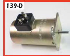
139-D Solenoid #PO.211726