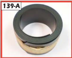
139-A Cover Band #PO.033960