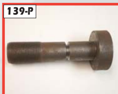
139-P Shear Bolt #PO.230364