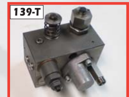
139-T Hydraulic Valve Pump #PO.028393