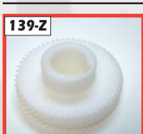
139-Z Plastic Helical Gear Big