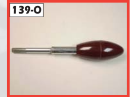
139-O Clutch Handle #PO.010958