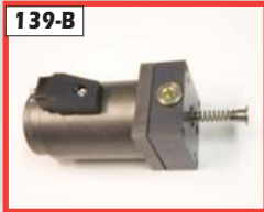
139-B S 2/2 Valve Grounded #PO.035132