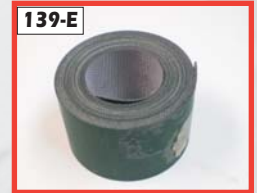
139-E Slot Covering Tape #PO.224650