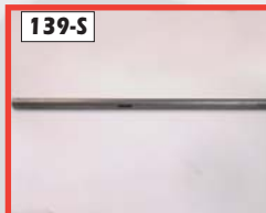
139-S Axle #PO.258560