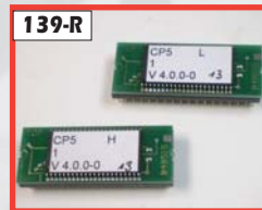
139-R Mini PC Boards #PO.404806