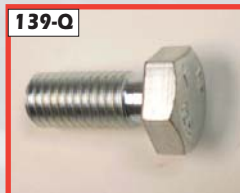
139-Q Hexagon Head Screw Special Hardness #PO.409569