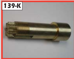
139-K Pinion Gear #PO.256696