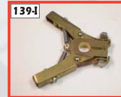
139-I Brush Holder #PO.225903