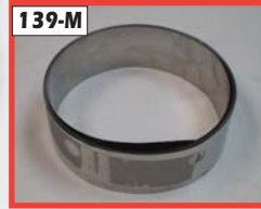
139-M Distance Washer #PO.245025