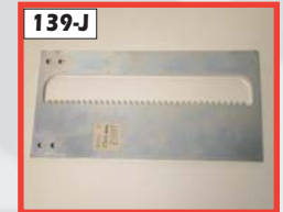
139-J Toothed Plate #PO.256697