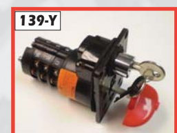
139-Y "Keyed" Main Power #PO.212114