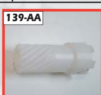
139-AA Plastic Helical Gear Small