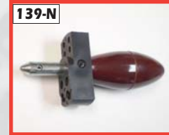
139-N Knife Holder Cpl. #PO.010113