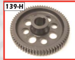
139-H Toothed Wheel #PO.245254