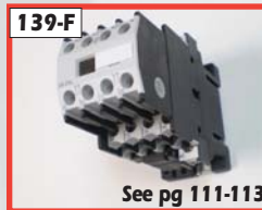
139-F See pg 111-113 Contactor #PO.227041