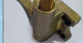
Threaded Block - AKA Bearing D.S. #53.072.205