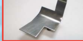
Sheet Guide Plate O.S. #53.072.216