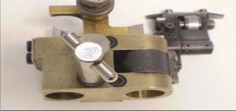
Side Guide Ass'y - Operator Side A.K.A: Bearing O.S. #53.072.204