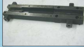
Operator Side #66.072.004