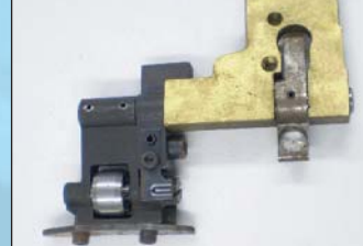
Lower Side Guide Ass'y AKA: Bearing Operator Side #53.072.204