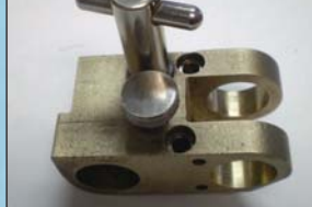
Drive Side Block #53.072.201