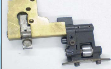
Lower Side Guide Ass'y AKA: Bearing Drive Side #53.072.203