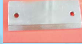
Magnet - AKA plate complete #66.072.145F Longer