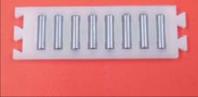
Skate Bearing (6X) #00.550.0477