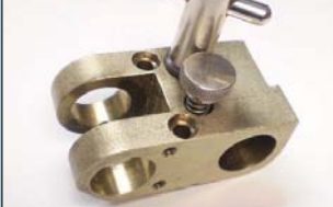
Operator Side Block #53.072.202