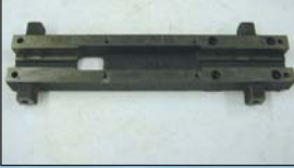
Drive Side #66.072.003