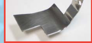
Sheet Guide Plate D.S. #53.072.215