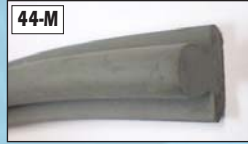
44-M Profile Rubber Lace 72/102 #93.021.023 MO #53.021.024