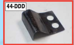
44-DDD Sheet Stop Spring #66.013.051