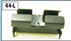
44-L Clamping Piece 93.021.079