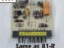
Same as 81-R TSV-090 #00.270.1071