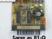
Same as 81-Q TSV-023 #00.270.0449