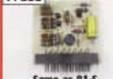
Same as 81-S TSV-063 #00.270.0496