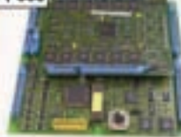
EWM 2 #00.785.0096 with ZTK #MX036.524