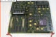
RGP #00.785.0025 with RRM #00.785.002